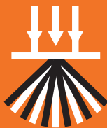
Gamma Ray Burst