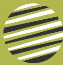
First Brown Dwarf